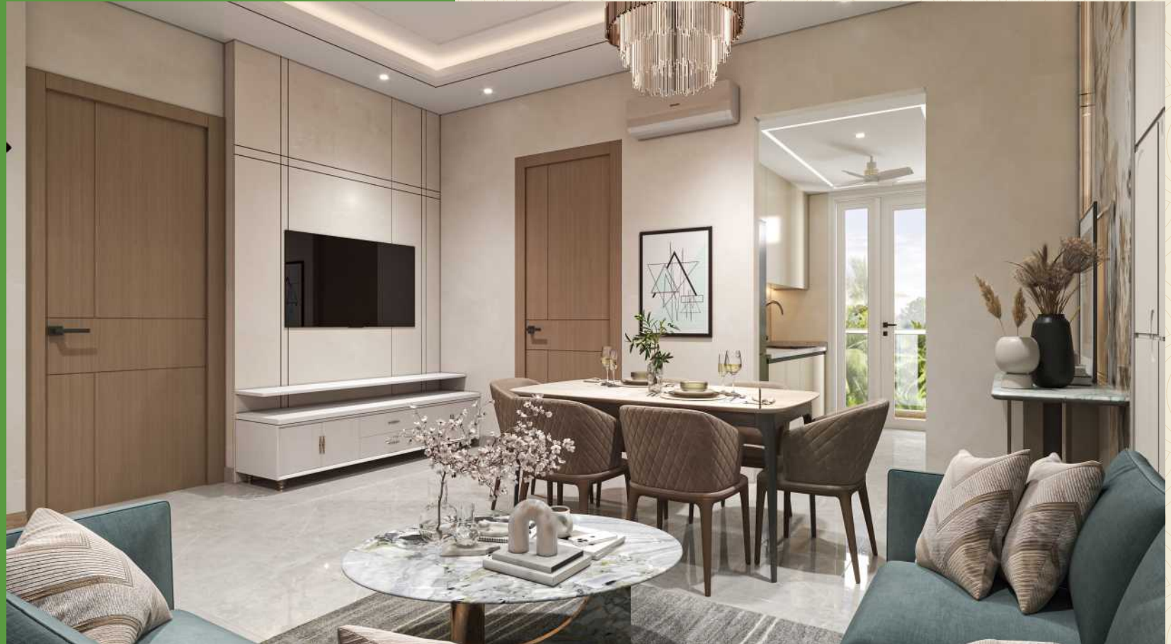
ARTISTIC VISUALISATION: LIVING & DINING AREA

At Nivasa, every low-rise floor is thoughtfully planned to maximise efficiency and comfort. Smart layouts, green features, and healthy design principles create positive, well-balanced living spaces. With better space utilisation and modern planning, homes feel more open—giving you more room to live, grow, and enjoy everyday life.