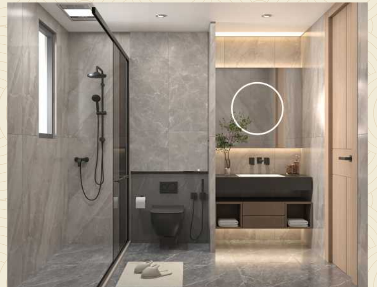
ARTISTIC VISUALISATION: BATHROOM