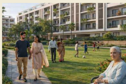
STAY FIT IN LANDSCAPE PARKS