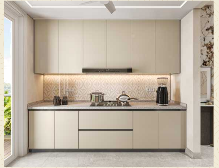
ARTISTIC VISUALISATION: KITCHEN