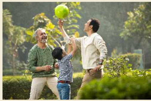
FREE OPEN SPACES TO PLAY SAFE

At Nivasa, wellness begins with movement. Thoughtfully designed low-rise floors encourage active living, fitness, and healthier daily routines, set within calm surroundings that support overall physical well-being.