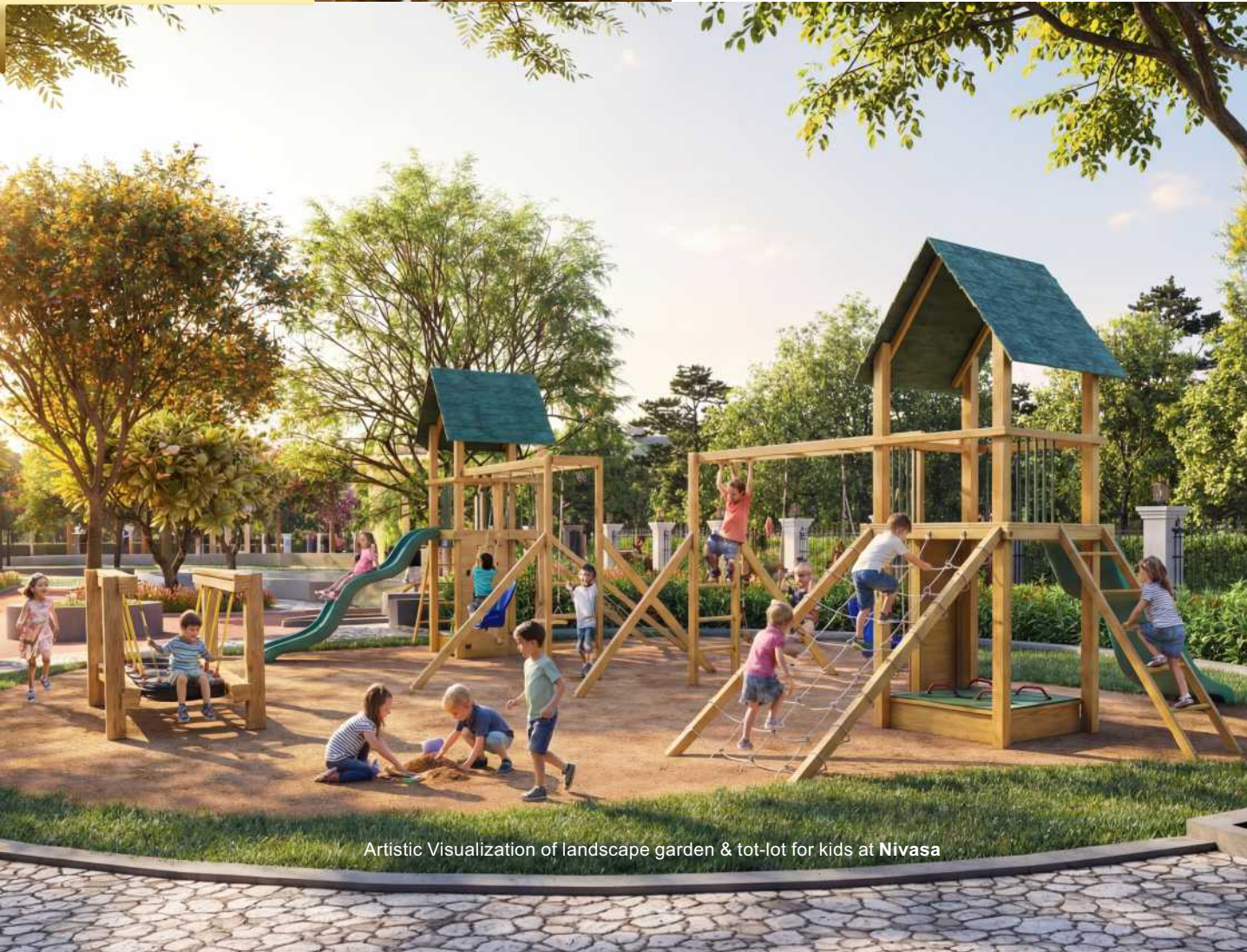
Artistic Visualization of landscape garden & tot-lot for kids at Nivasa

Families come together at Nivasa, sharing laughter and quality time in happy open spaces, supported by well-planned amenities that encourage comfort, connection, and everyday togetherness.