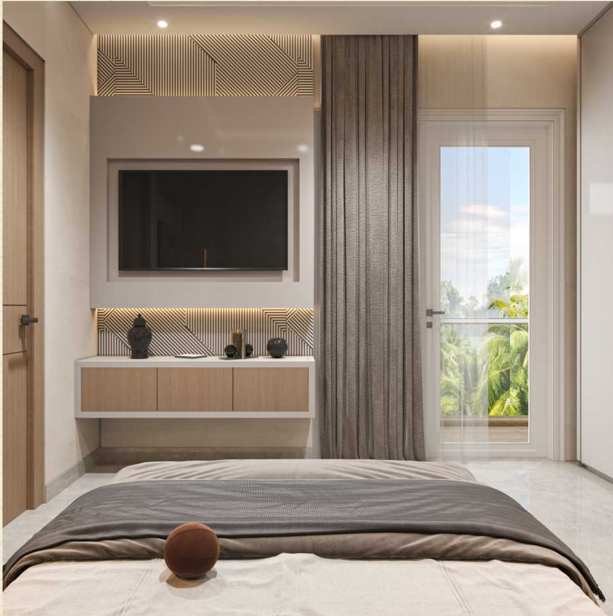
ARTISTIC VISUALISATION: BEDROOM SPACE