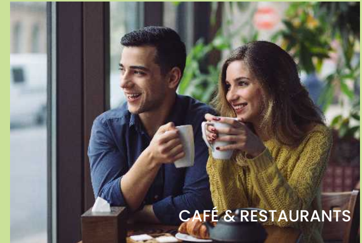
CAFÉ & RESTAURANTS